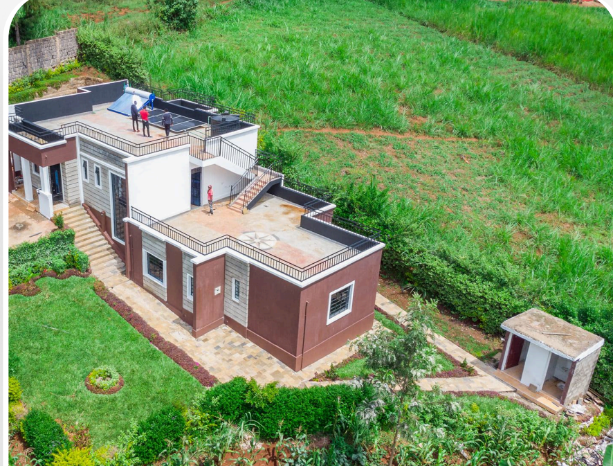
Flat-Roofed 4 bedroom maisonette