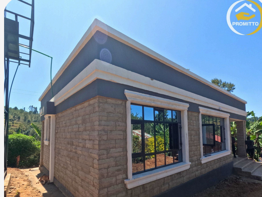
2-bedroom Interlocking Blocks Bungalow